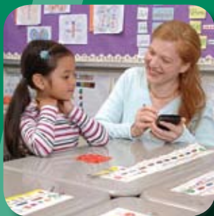
Innovative Teaching and Learning